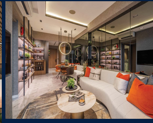
3 - Bedroom Grande