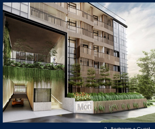
2 - Bedroom + Guest