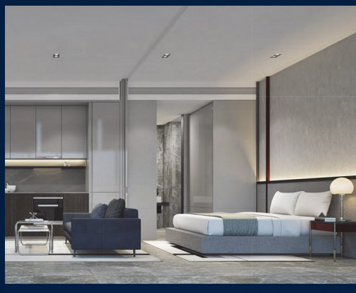
1 - Bedroom + Study