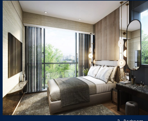
3 - Bedroor