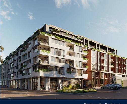
Roden: 2 - Bedroom