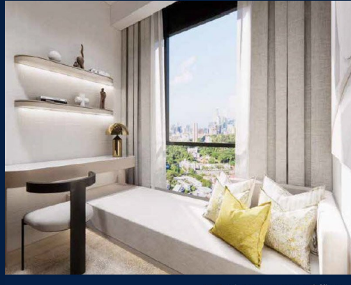
4 - Bedroom + Home Office