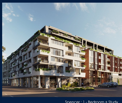
Spencer: 1 - Bedroom + Study