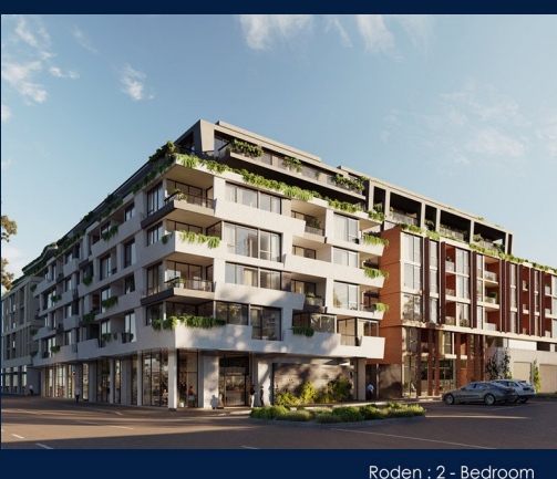
Roden: 2 - Bedroom